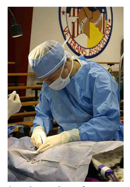
A veterinary student performs surgery during a HSVMA Field Services clinic.

shelter medicine rotations, feral cat clinics or other clinical settings—give students the opportunity, under supervision, to interact with live patients, increase their learning opportunities and provide beneficial treatment for the animals. Many veterinary schools are partnering with local animal shelters and rescue groups to provide spay and neuter services for dogs and cats who are then returned for adoption. The use of models, mannikins and simulators, multi-media computer simulation, and ethically-sourced cadavers provide options for anatomy training, clinical and surgical skills practice, improved conceptual understanding and problem-solving capabilities, and hands-on training that treat and/or benefit live animals.