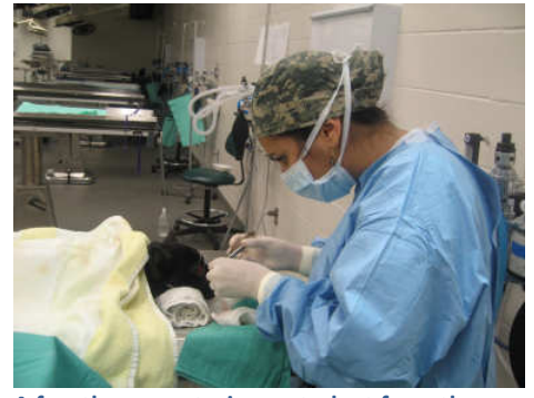
A fourth-year veterinary student from the University of Florida repairs a cherry eye.

an enthusiastic response from veterinary students and animal rescuers.