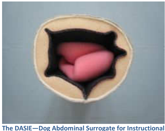
The DASIE—Dog Abdominal Surrogate for Instructional Exercises