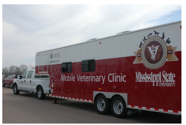
The Mississippi State University's Mobile Veterinary Clinic.

a mobile veterinary unit owned by the school. During that rotation they make two trips to shelters and during those trips perform, on average, between 15 to 20 sterilization surgeries. Both the surgery labs and the CVS shelter trips are now part of the required curriculum. In the fourth year, Mississippi State offers a Shelter