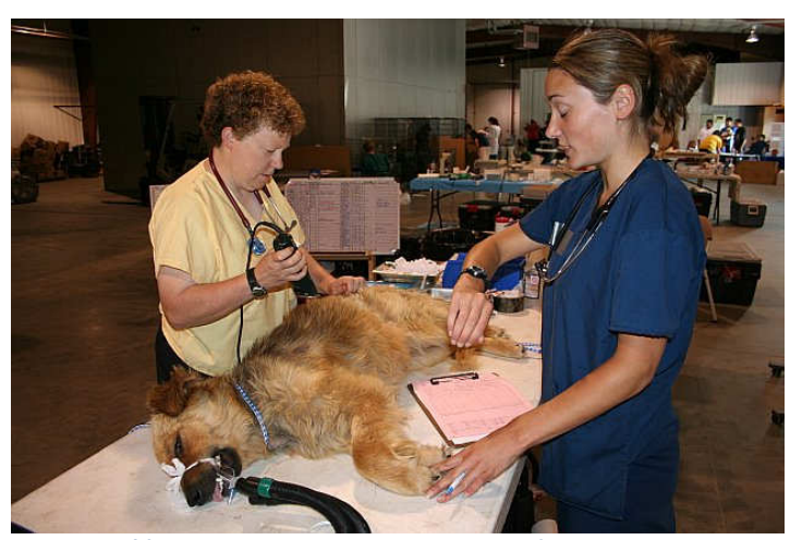
HSVMA Field Services in action—surgery prep and surgery.