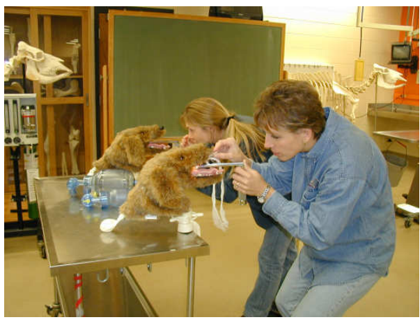
Veterinary students learn intubation using the Rescue Critters® K-9 Intubation Trainer.