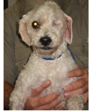
A HAARTS patient recovering from an eye-enucleation.