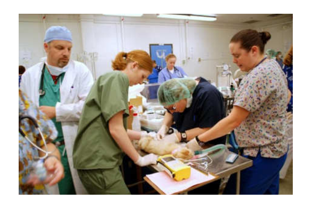
Second, third and fourth-year students prepare a feral cat for surgery and monitor anesthesia under the supervision of an anesthesia resident.

The veterinary college at Iowa State University hosts a similar clinic run by the Feral Cat Alliance, a volunteer group made up of students and faculty from the school.<sup>7</sup>