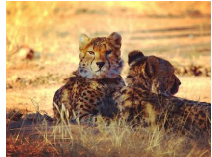
Cheetahs in Namibia