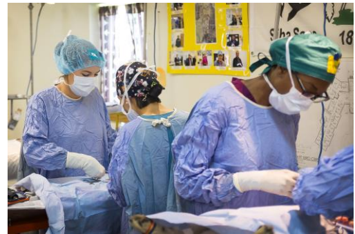
Veterinary students assisting with surgery at the Cheyenne River clinic

Due to the uncertainty of the pandemic and concerns about the safety of the communities within which RAVS operates, the program has decided to postpone opening applications for next year until early 2021. Student informational and volunteer recruitment presentations will also be postponed until we all have a better sense of what specific opportunities will be available. HSVMA and RAVS will reach out with updates as clinic plans are