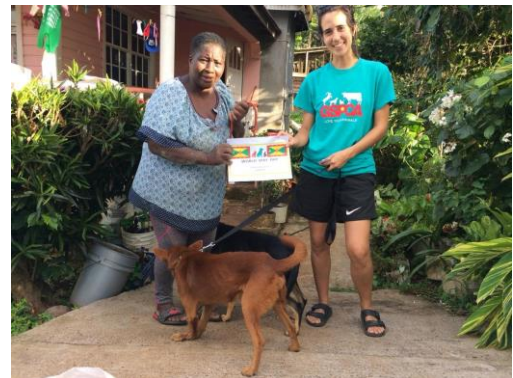
A Grenada resident has her pets seen by the Grenada SPCA and vet students attending St. George's SVM