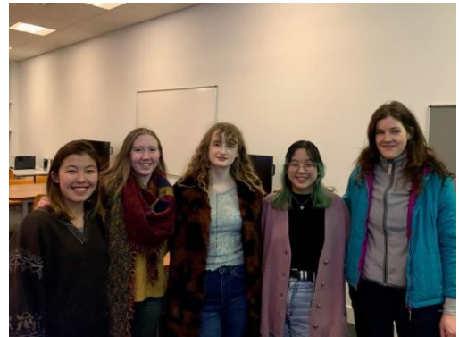
University of Edinburgh student chapter members at an event in 2020

April 18-24 was National Volunteer Week and HSVMA celebrated all the volunteers who are an integral component of our work. Our Student Representatives and Student Chapter Officers help us bring welfare-related topics to the next generation of humane leaders across the globe. Despite extremely busy academic schedules, these student volunteers commit themselves to spreading the word about our organization and its mission. For this, we are forever grateful and humbly thank each one of you for your tireless efforts! Our Facebook page posted the top ten reasons why we love our volunteers and shared some highlights of their work. For those who would like to stay involved with HSVMA after graduation, our State Representative program is a great way to advocate for animals at the local, state, and federal levels as a veterinary professional. We could not do what we do without our volunteers! Thank you!