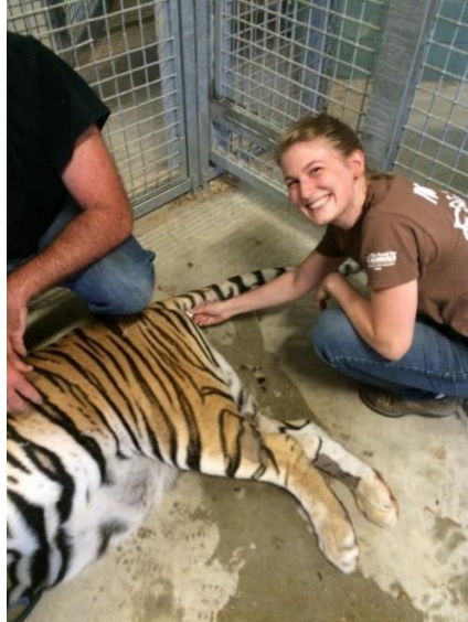
Veterinary student externs at Cleveland Armory Black Beauty Ranch