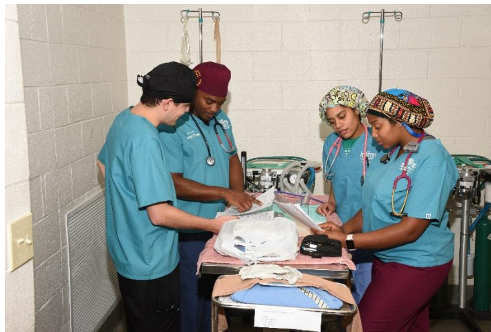
Veterinary students at Tuskegee University prepping for surgery at World Spay Day 2018

HSVMA is kicking off a series of informal surveys to find out more about what veterinary schools are offering in their curriculum and programs as it pertains to the animal welfare and access to veterinary care. We are asking veterinary students to complete the first survey about the kinds of spay/neuter services offered to shelter/rescue animals, community/feral cats, and low-income clients. As a thank you for participating, you have the option to be entered into a raffle for a HSVMA scrub top and a hard copy of Wildlife Care Basics for Veterinary Hospitals . Please take a few minutes to complete the survey and let us know about your curriculum! Thank you!!