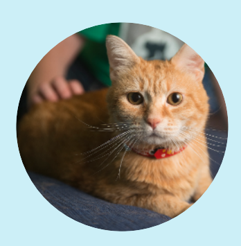
February 14, 2024 8 p.m. ET / 5 p.m. PT

Claw Counseling: Living with Cats with Claws