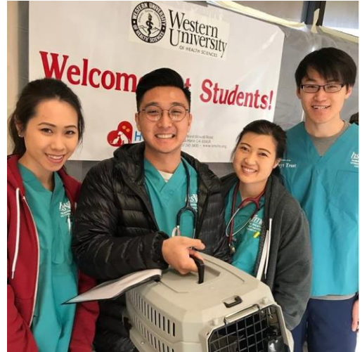
Western University student chapter volunteering at World Spay Day clinic (2018)