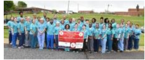
2018 World Spay Day clinic at Tuskegee University CVM

For eight years, HSVMA has sponsored World Spay Day events at veterinary schools to help prevent overpopulation of companion animals through sterilization while at the same time providing veterinary students with training to learn these life-saving procedures. February 2019 is Spay/Neuter Awareness Month and that means HSVMA will again be offering World Spay Day grants of up to $2,000 to schools whose veterinary students participate in a spay/neuter clinic either on campus or in conjunction with a local shelter or rescue organization during February. The funds must be received by a non-profit entity which can provide a W-9 for tax purposes. Students who are organizing a clinic at their school or with a local shelter or rescue group can contact Heather at hschrader@hsvma.org to receive a HSVMA World Spay Day Grant Application.