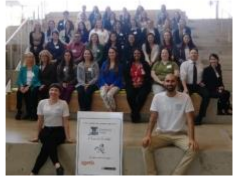
Some of the attendees of the 2018 Animal Welfare Symposium at Cornell University CVM