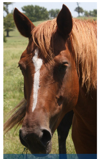
Equine welfare was the focus of an HSVMA CE webinar during 2022.