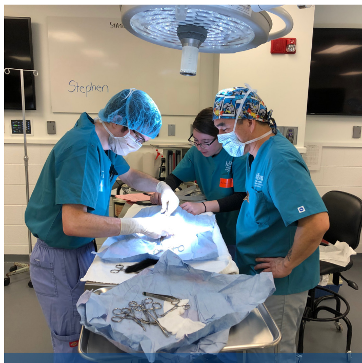
Cornell veterinary students being supervised during surgery at a World Spay Day clinic.