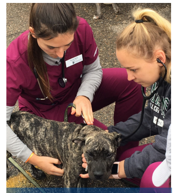
Photo Caption: Veterinary students from Michigan State University participate in a Street Dog Coalition clinic in Detroit.

For more volunteer options and information, visit www.hsvma.org/volunteering .