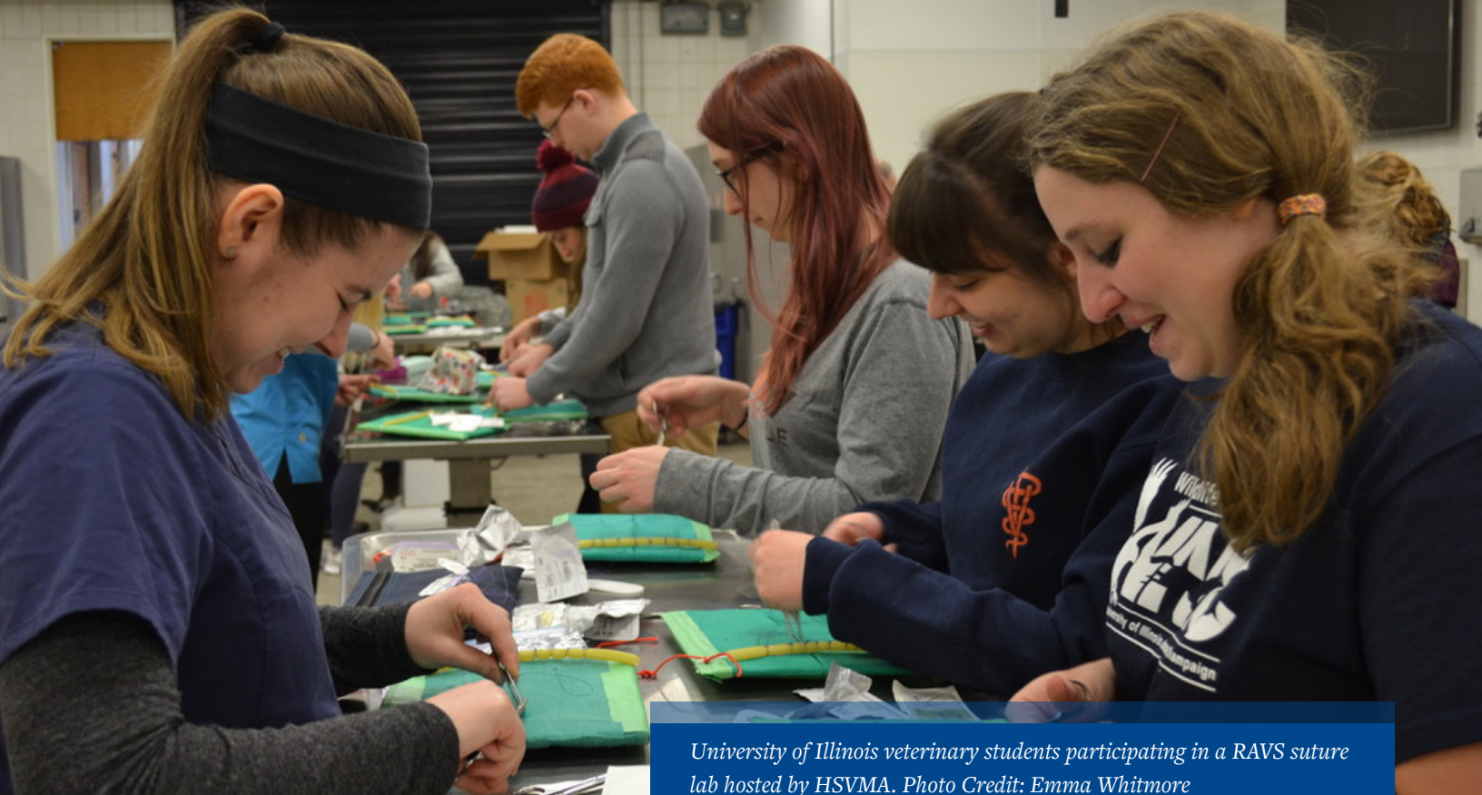
University of Illinois veterinary students participating in a RAVS suture lab hosted by HSVMA.