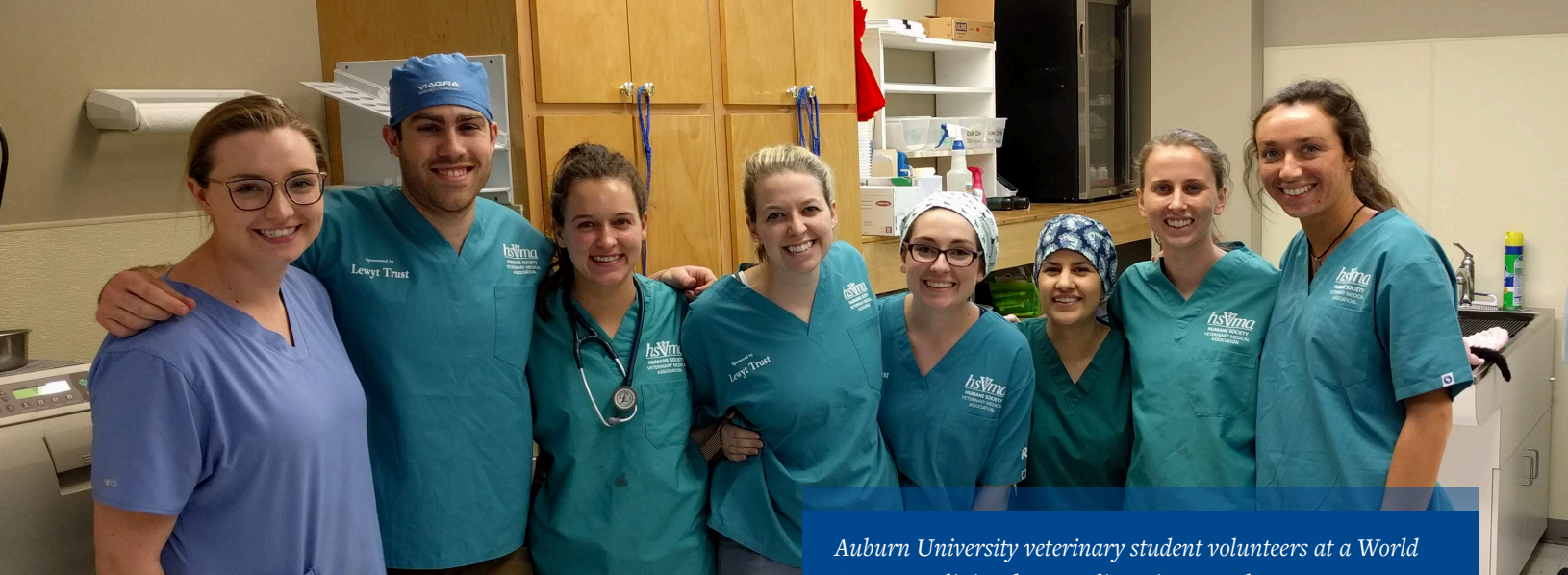
Auburn University veterinary student volunteers at a World Spay Day clinic.