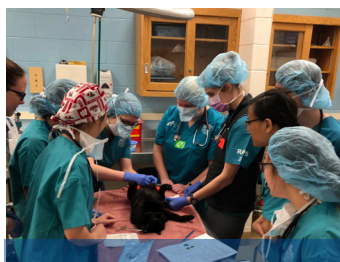
Students observing a cat neuter at a World Spay Day clinic at University of Wisconsin.

In 2019, HSVMA supported World Spay Day events involving students from four different schools. These events provided sterilization surgeries for more than 150 animals in need!