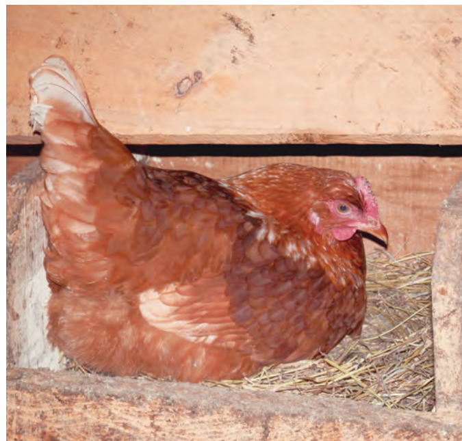
Another popular webinar topic in 2013 was “Backyard Poultry.”

Current HSVMA members have free access to all of our webinars, and the webinars are archived at hsvma.org/webinars for those unable to view the live presentation. CE credits are also available for viewing the recorded versions after completing a quiz.