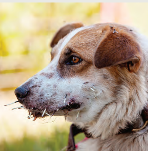
RAVS volunteers removed dozens of porcupine quills from this patient's face and mouth.