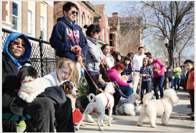
People lined up early for the PFL event in Chicago.

Teams of California veterinarians visited the local offices of their own state Senators to convey support for AB 711, a bill to require the use of only non-lead ammunition in hunting. As constituents and veterinarians, they were able to communicate firsthand knowledge of the harmful effects of lead toxicity on animals.