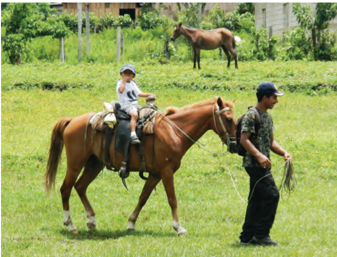
A patient and clients returning home.

What generates this ripple effect? I believe it is seeing animals without any access to veterinary care arrive at the clinic in the mornings, nervous and overwhelmed, reunited with their caregivers after a day in surgery with tails wagging and throats purring. Seeing horses and their owners walk home after a surgery or treatment, knowing health and worth have increased exponentially for both the horse and the family. Usually, the now-vaccinated trusty family dog is trotting along behind. Watching student skill and confidence grow over the course of a clinic and hearing their comments of sincere appreciation and gratitude at the end of the course. Working with passionate individuals who want to help create positive change, developing relationships that will last a lifetime. At its core, RAVS is all about relationships. These relationships create sustainability which allows the ripple effect to radiate out improving animal welfare all over the world.